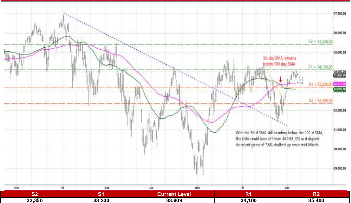
Chart 2 – DJIA