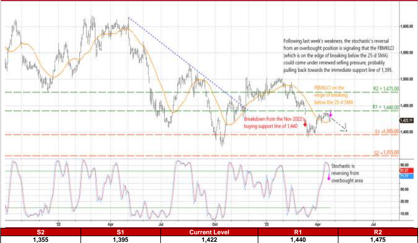
Chart 1 – FBMKLCI