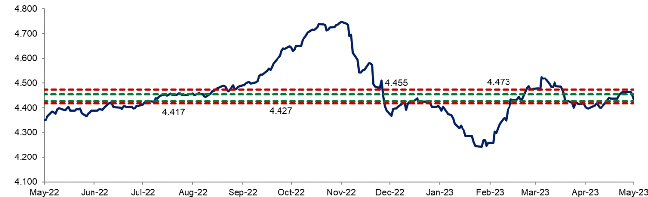
Graph 1: USDMYR Trend