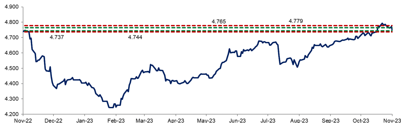
Graph 1: USDMYR Trend