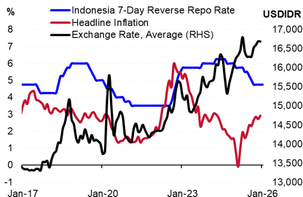
Graph 1: Inflation, Policy Rate and USDIDR trend